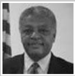
The Crisis in Zimbabwe (PARADE.com)