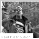
O'Reilly and Geraldo Clash Over 'Occupy' Protests (FoxNews.com)