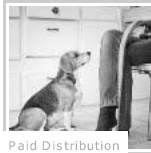
Why Does My Dog... Stare at Me? (Vetstreet)