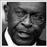
Can Cain's Campaign Recover (PARADE.com)